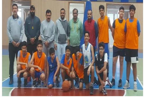
SUB JUNIOR BOYS GOT 3<sup>RD</sup> POSITION IN I DELHI STATE TOURNAMENT (BASKETBALL)