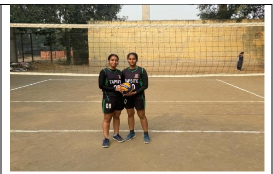
U-19 GIRLS 2 GIRLS(APS DK) OF VOLLEYBALL GOT 3<sup>RD</sup> POSITION IN DELHI STATE (VOLLEYBALL)